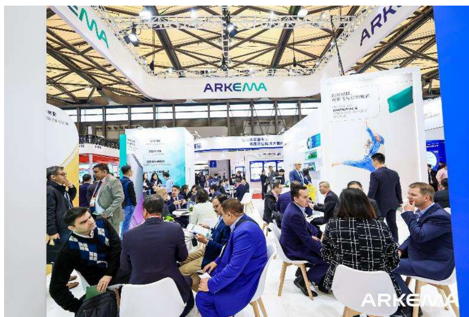
Arkema features its leading portfolio of high performance and sustainable materials

The company features its leading portfolio of high performance and sustainable materials, including solutions for UV/LED, waterborne, high solid technologies and high performance polymers.