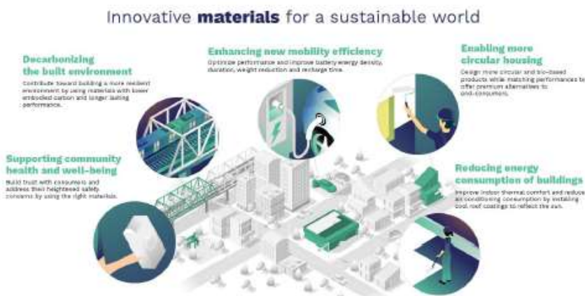
Arkema’s new sustainable offers for the industry

Guided by the Group’s sustainable development strategy, Coating Solutions segment is focused on accelerating the transformation of the coating sector through four major aspects: phase out of hazardous substances, the quest for more circular raw materials, development of more efficient and sustainable technologies and the evolution of application processes toward greater industrial and energy efficiency.